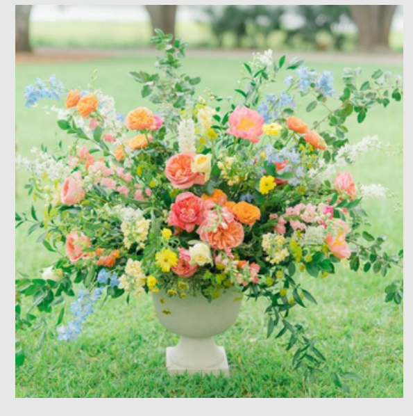
Some words to describe our style include:

MODERN LUXE ABUNDANT COHESIVE BRIGHT TEXTURED GARDEN BOLD WHIMSICAL