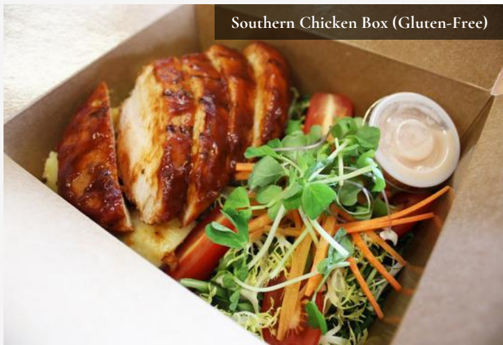
Southern Chicken Box (Gluten-Free)